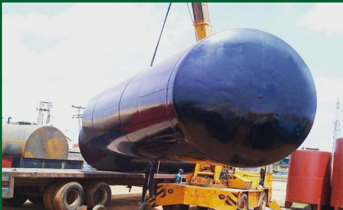
Double walled tank lifted at the workshop