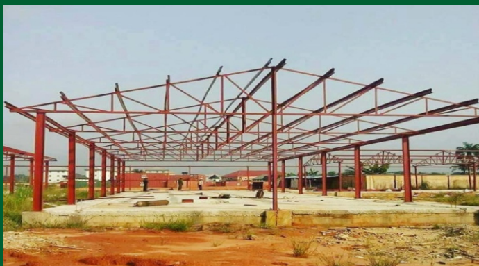
Completed Structural work at Magboro, Ogun State