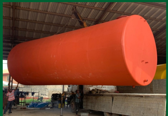
Petrol /Diesel Liters Tank Construction