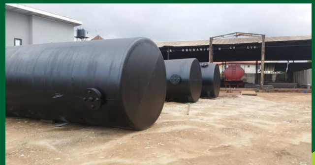
Corrosion Resistance Underground Tank

45,000 litres underground tank - Ectco Nigeria Limited