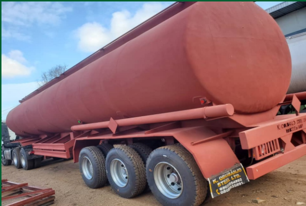
45,000 litres tanker at the workshop