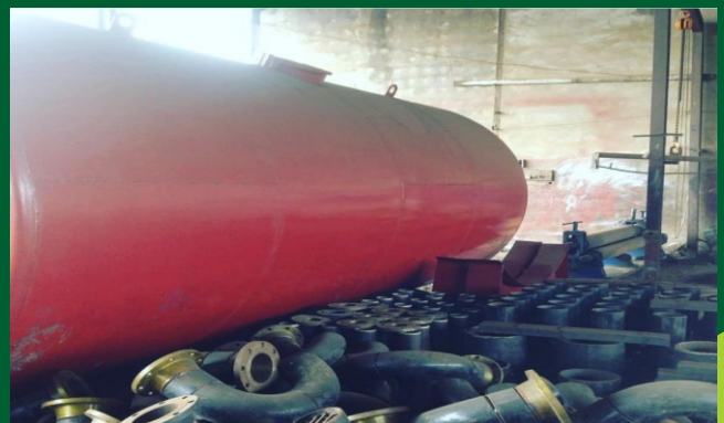
35,000 litres surface tank and petrolex fitting at the workshop