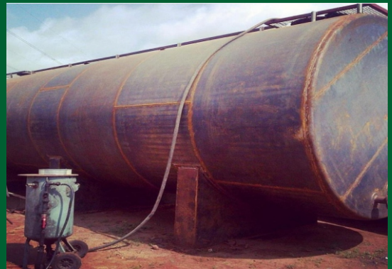
100,000 Litres surface tank