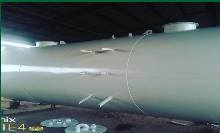
Doubled jacked tank with 10mm thick plate for Shapooji (location: Evarcare hospital)