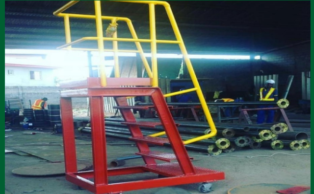
Mobile ladder for coke and petrolex fittings going on in the workshop