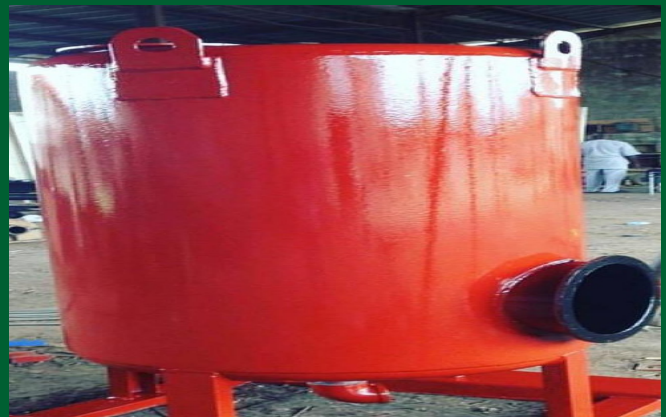
Treatment tank at the workshop for DLK Oil and Gas