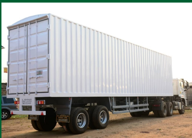
40tons box body for Total