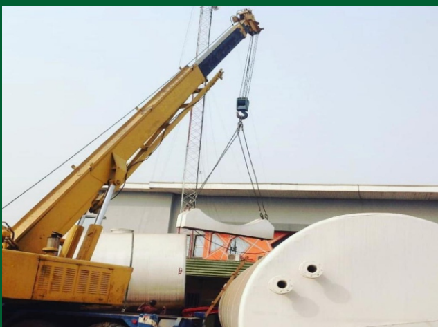
100,000 litres job lifted at the workshop by crane