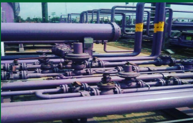
Early Production Facility, Flow Station at Oredo, Edo State for Obax Worldwide