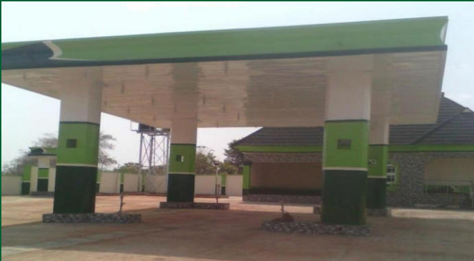
Filling Station canopy made for Borgu Petroleum Ltd., New Bussa Niger State