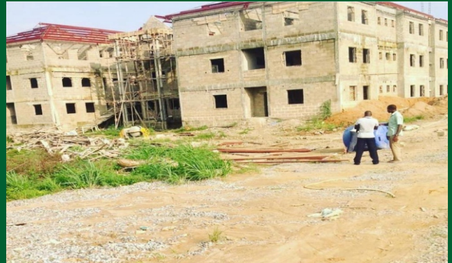
Truss Job at Deeper Life, Mowe